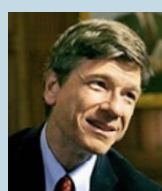
Prof. Jeffrey Sachs Director of The Earth Institute, Columbia University (via video conference)