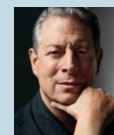
Al Gore Former US Vice President, Chairman, Generation Investment (via video)