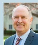
Prof. Ross Garnaut AO Professorial Research Fellow in Economics University of Melbourne