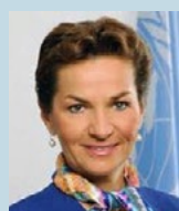
Christiana Figueres Executive Secretary, UNFCCC (via video)