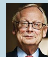
Lord Deben Chairman, UK Committee on Climate Change