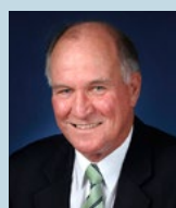
Tony Windsor Former Independent Federal Member for New England