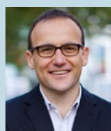
Adam Bandt Greens MP Melbourne